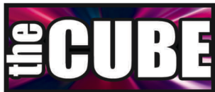
The Cube (Reception)