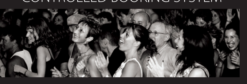
All pictures, logos or trade names used in this booklet are the property of Ceroc Enterprises Limited and cannot be copied, used or reproduced.