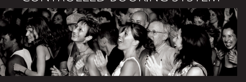
All pictures, logos or trade names used in this booklet are the property of Ceroc Enterprises Limited and cannot be copied, used or reproduced.