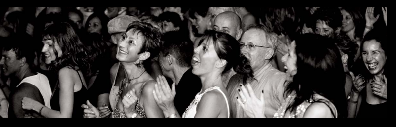
All pictures, logos or trade names used in this booklet are the property of Ceroc Enterprises Limited and cannot be copied, used or reproduced.

15 DIFFERENT DANCE NVFR ST RIFN NRKSHOPS FRFFST JG FFFRF Ι - Δ <u>Cl</u> )EU SF R E GF BOOKING NATROLLED SYSTEN